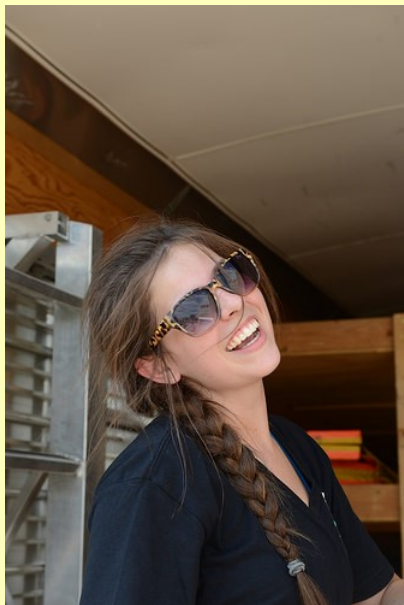
Yup! Smiling during band camp!

Front Ensemble gets the bloody hand prize. Poor kids and blisters in the palms of their hands by day 3. Couldn't keep them down though! They bandaged up and went right back to work!