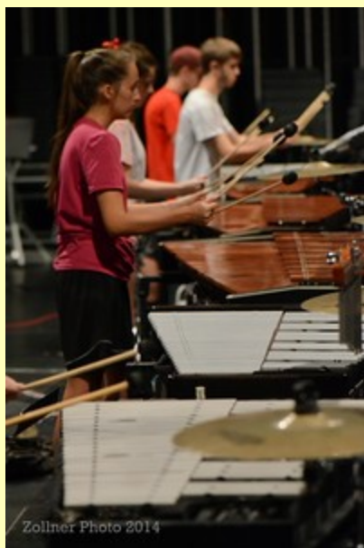
Zollner Photo 2014