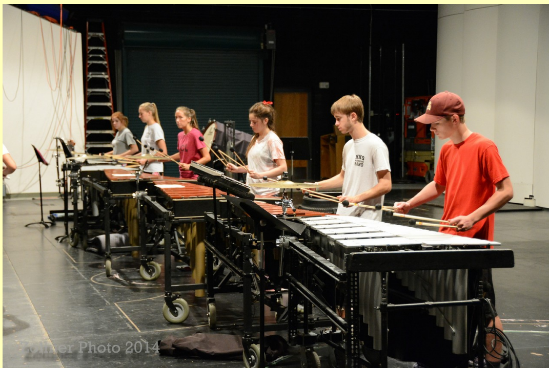
Zollner Photo 2014