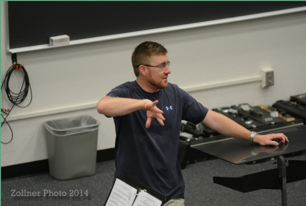
Classic Bennett Move