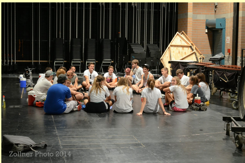
Zollner Photo 2014